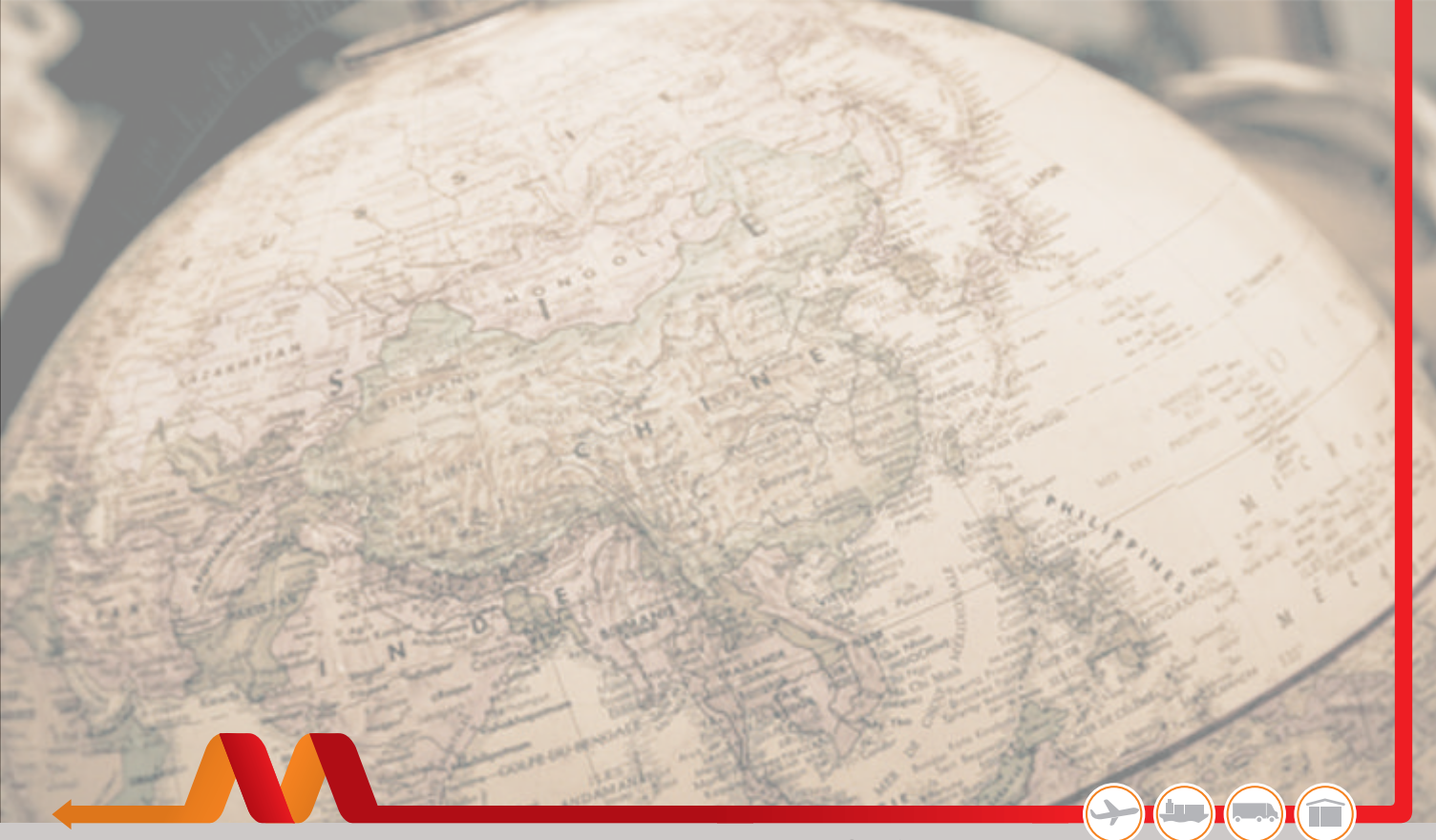
yes ! we can do it !!

Mansarovar Logistics Pvt. Ltd. was incorporated on 8<sup>th</sup> September 2006 at Jamshedpur. It commenced commercial operation from 1<sup>st</sup> April 2008 through the takeover of all the activities of the partnership firm M/S Jhanda Singh & Co. (Established on 24<sup>th</sup> December 1973 at Jamshedpur), a reputed service provider to Steel Mill and Iron Ore mines in Eastern India. The directors of this company were also the only partners of the above firm.